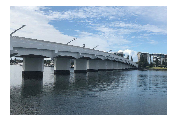
Barriers and Piers