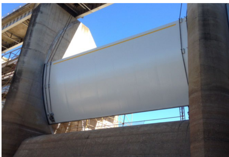
Spillway Gate Structure - Upstream